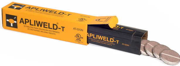
APLIWELD®-T Welding compound tablets