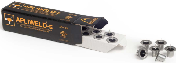
APLIWELD®-E Electronic ignition caps