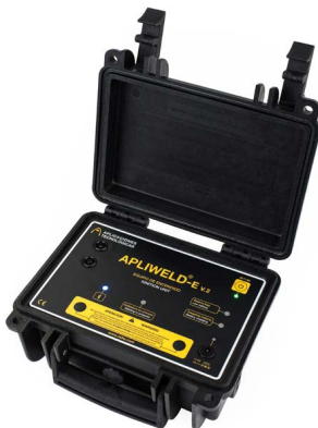
Kit APLIWELD®-E Electronic ignition device Now includes Bluetooth remote ignition device