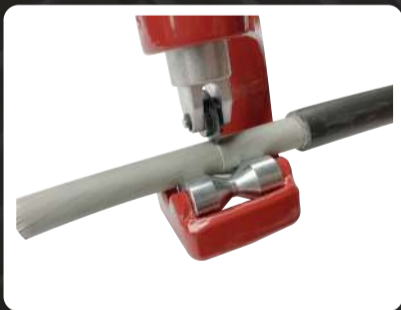
STEP 4: CIRCUMFERENTIAL CUT ON INNER SHEATH