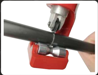
STEP 1: CIRCUMFERENTIAL CUT

Complete 5-step process of using the SACS® Tool. Cutting wheel depth will vary according to cable size, progressive advancement is best.