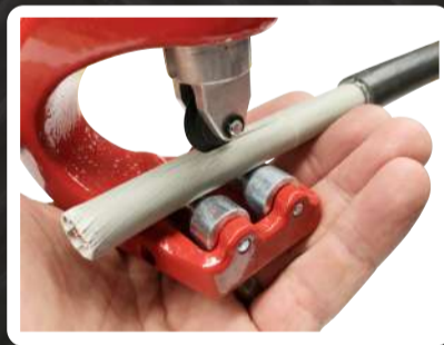
STEP 5: LONGITUDINAL CUT & REMOVAL OF SECONDARY SHEATH