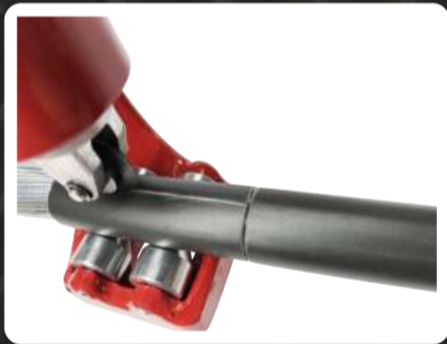
STEP 2: LONGITUDINAL CUT